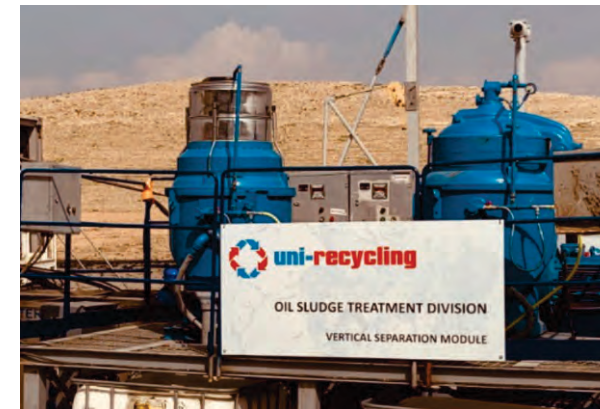
Vertical separation modules to increase quality of recovered oil