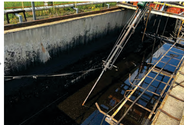
Homogenization of the material before extraction