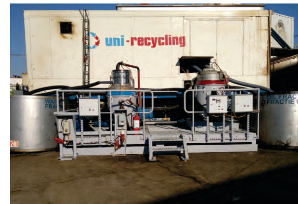
Resulted fractions after separation