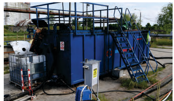
Pre-treatment special equipment