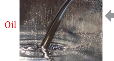
Water content and sediment in recovered oil up to <1%