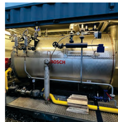
Heating and Conditioning

Depending on the criteria and requirements of the Client, but also on the imposed legislation, we adapt our own technologies and equipment specifically for each project.