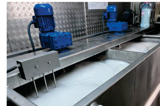
Automatic Polymer Dosing Station