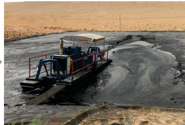
Special designed equipment for homogenization and extraction of the oil sludge