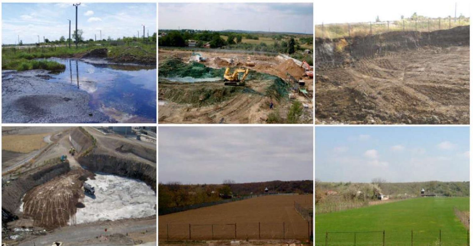
Overview of the operation for a contaminated site with hydrocarbons

As this is a treatment involving mechanized principles, and taking into account the geological structure of the contaminated soil for which this technology is implemented, it is necessary to carry out complementary excavation and sorting operations to streamline the proper incorporation of additives used in soil mass for reducing the impact of pollutants, which by implementing this technology eliminates or reduces the negative impact on the environment.