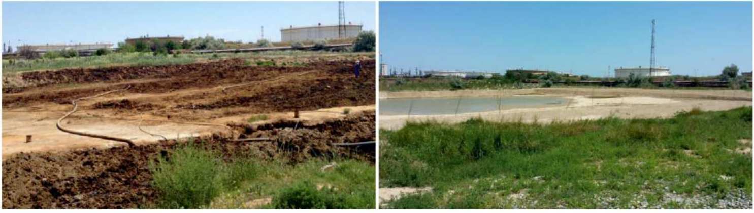
Contaminated site polluted with hydrocarbons remediated by Bioremediation technology